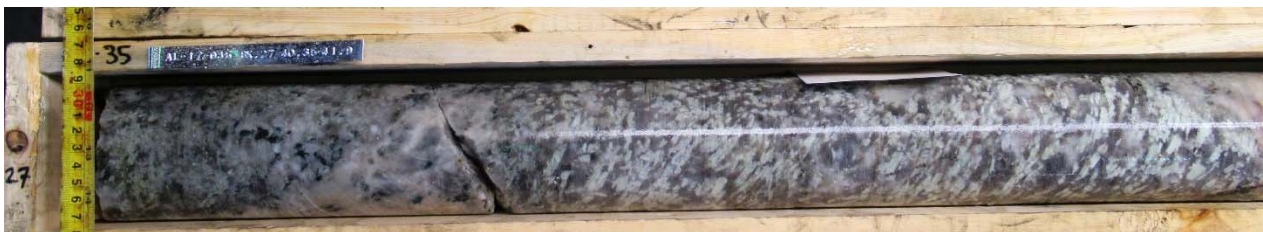
Figure 2: Hole 17-35 from 35 metres