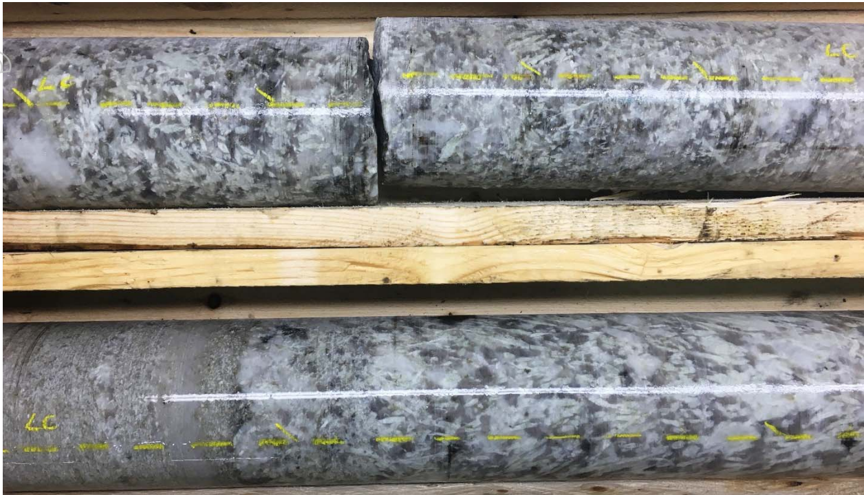
Figure 1: Hole 17-36 from 75 metres