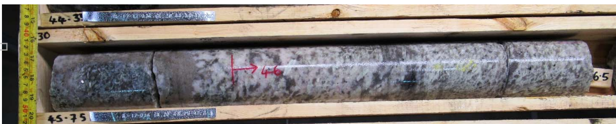
Figure 3: Hole 17-34 from 45 metres